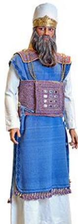
The Menorah, the priestly garments and one of the implements